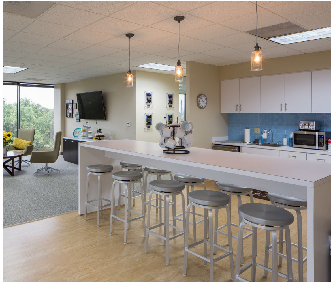
Nothing Bundt Cakes Headquarters, Suite 350